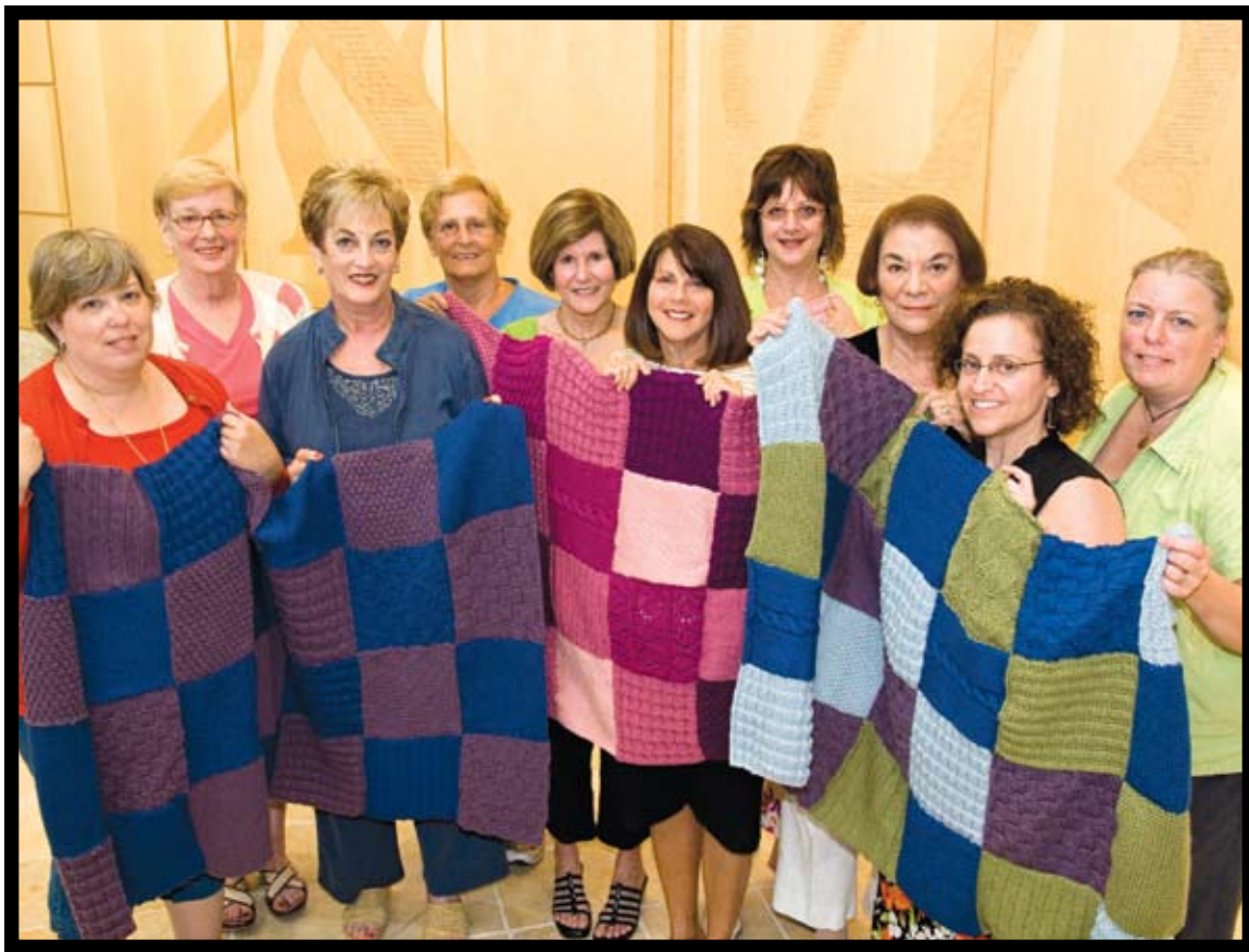
Volunteers with the Weinstein Jewish Community Center knit together blankets for patients of the VTCC.