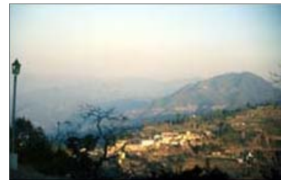
Chandigarh's Morni Hills