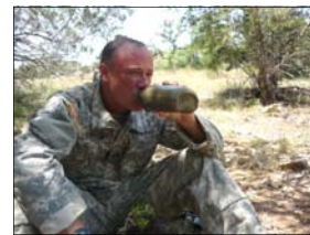
On Reserve Duty 2009