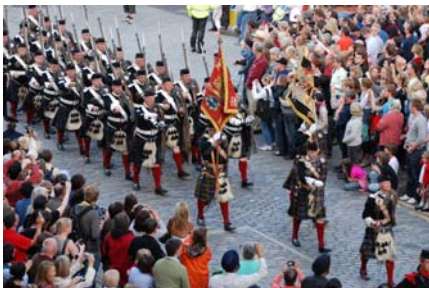
A Sea of Clan Tartan

The event was special to me for two reasons. I stayed in an apartment called "Ladystairs" which overlooked the Royal Mile, just steps