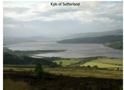
Kyle of Sutherland

I felt perfectly at home everywhere I went. Everyone speaks English. There are also many Gaelic speakers especially in the Highlands, and road signs are in both languages (my next project is to learn a little Gaelic). The word for Scotland in Gaelic is Alba, pronounced "Alabah." According to the PanAlba website, Scotland is a country of 5 million people, with 35 million individuals of Scottish ancestry living worldwide. In the spirit of The Gathering 2009, many went home for an unforgettable visit. I am thankful for the opportunity to participate in a national homecoming, and for the kindness of Priscilla and Graham. I hated to say goodbye, and I can still hear the echo of their farewell "Haste Ye Back."