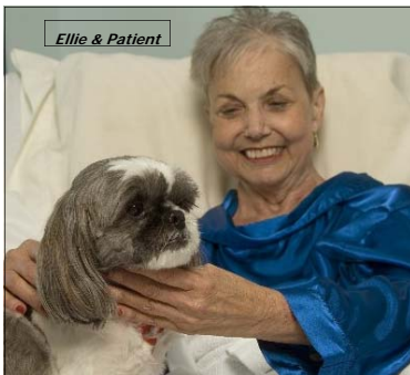
Ellie & Patient

Housed in the Department of Psychiatry, The Center for Human-Animal Interaction (CHAI) was established in the VCU School of Medicine in June 2001. It is the first center of its kind to be established in a school of medicine in the nation. The mission of the Center is improved health and well-being through human-animal interaction. As an interdisciplinary center, CHAI provides a structure for faculty, students, and staff from both campuses to collaborate on research, educational, and clinical activities that support its mission. CHAI has been recognized internationally for its pioneering efforts in these areas.